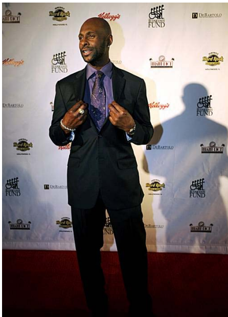
Jerry Rice arrives for his "Miami Rice" Super Bowl party.